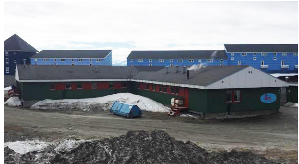
Naja Aleqa Day Care, Qeqqata Komunia