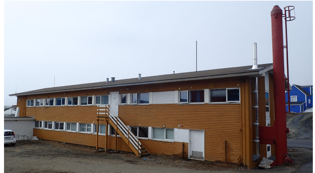
Municipal Technical and Environmental Department, Qeqqata Komunia